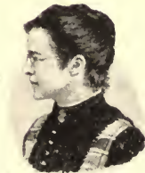
LOUISE IMOGEN GUINEY, BOSTON.